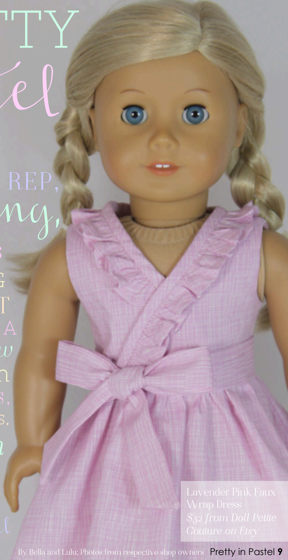
Lavender Pink Faux Wrap Dress $32 from Doll Petite Couture on Etsy

PRETTY in pastel Pastels have a BAD REP, but this spring, designers are SELLING these SOFT pieces IN A new light. With CLASSIC CUTS, trendy patterns, and stylish details, PASTELS are a seasonal NEW favorite.