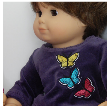
Purple Butterfly Tee $7, Emma’s Doll Shop