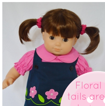
Flower Dress $15, Brittany’s

Floral details are cute choices for warmer weather.