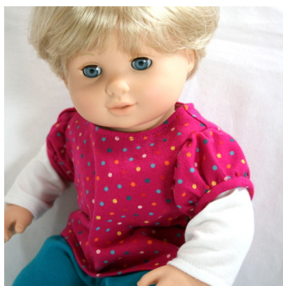
Knit Pants and Layered Tee $28, Cutie Pie and Me