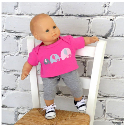
Pink Elephant Tee and Gray Leggings $18, Sew Fun Doll Clothes

Scouring Etsy and Ebay for cute Bitty outfits? Worry no longer – we’ve rounded up our favorite pieces for the littlest ones to rock this spring. Be prepared to say “aww!”