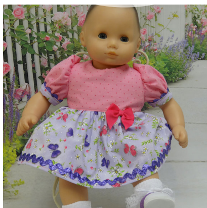
Garden Butterfly Set $38, Cupcake Cutie Pie