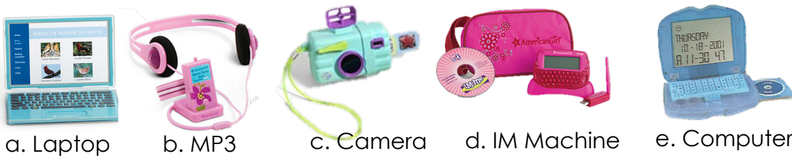
a. Laptop b. MP3 c. Camera d. IM Machine e. Computer

By Lulu / Pictures from the American Girl Wiki and the American Girl Site