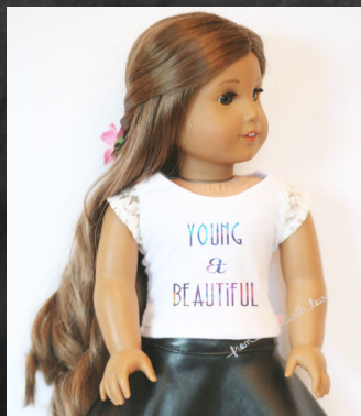
From Echo with Love