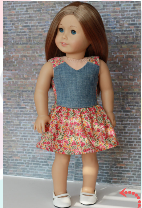
Closet 4 Chloe