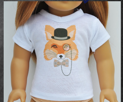
Lori Liz Girls and Dolls