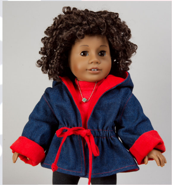
Val's Unique Boutique