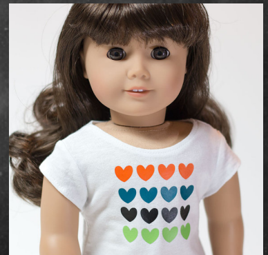
Aunt Katy Clothing