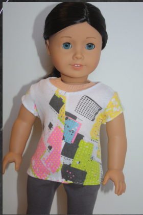
Lost in a Jungle

Let your small, but cute graphic peek through the opening of a pretty sweater.