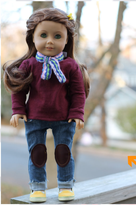
Mon Chat Dans La Lune